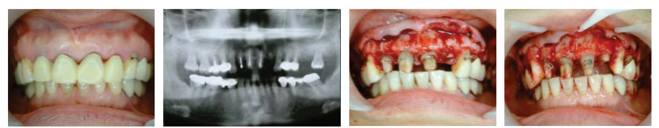
Case 5 (LtoR) Figure 5a. Moderate to advanced periodontitis with buccal exostosis of maxillary alveolus; Figure 5b. Panograph revealed residual root on #22 in the bone, post on #12-21, moderate bone loss on #13-17, 23-25, advanced bone loss on #27; Figure 5c. Buccal exostosis and residual root on #22 were noted after laser incision. Soft Mode: Initial incision with 1.0W, 100MJ, 10Hz, and then 2.0W, 100, 10Hz. Hard Mode: Removal of inflamed gingival tissue and osseous recontouring/osstectomy with 4.0W 200MJ, 20 Hz and then 6.0W, 200MJ 20Hz; Figure 5d. Normal osseous architecture was noted after laser ablation of exostosis and crown lengthening.